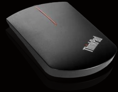
ThinkPad X1 Wireless ▶ Touch Mouse