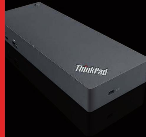
◀ ThinkPad Thunderbolt 3 Dock