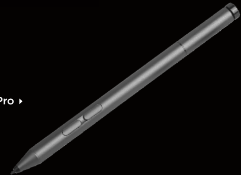
ThinkPad Pen Pro ▶